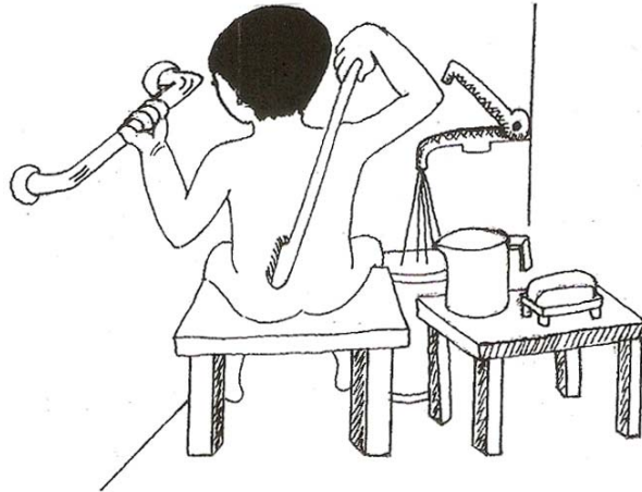
A long-handled brush makes it easier to clean the back

Reference: Awareness-Cum-Training Packages In Disability, Training In Daily Living Skills And Managing Difficult Behaviours. Unit-5, IGNOU School Of Continuing Education