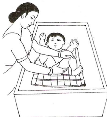
The baby is lying on a non-slip mat placed inside this tub. The mother is easily able to clean the child's body parts.